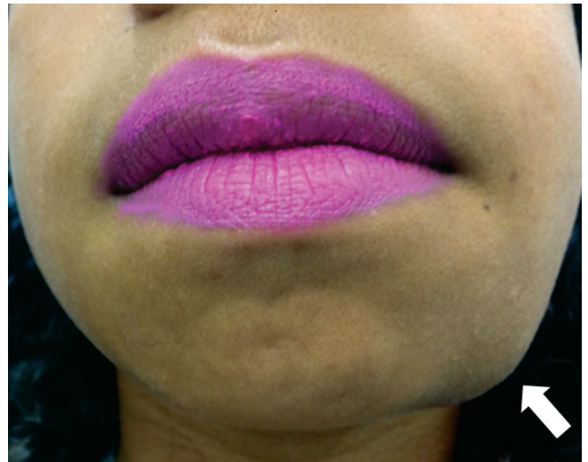
Figure 1: Frontal view of the patient showing well-delimited swelling in left side of the jaw (arrow).

A 11-year-old black female patient was brought to the stomatology service of the Federal University of Rio de Janeiro, with complaints of toothache and facial asymmetry. The patient presented a large cavity in her permanent lower first molar, and extra-oral examination revealed increased volume on the left side of the mandible with firm consistency and slight skin color alteration (Figure 1); however, no cervical lymph node was detected. On intraoral examination, the patient showed an extensive cavity on the left mandibular first molar, extensive destruction of the dental crown that reached root furcation, and slight bulging of the vestibular