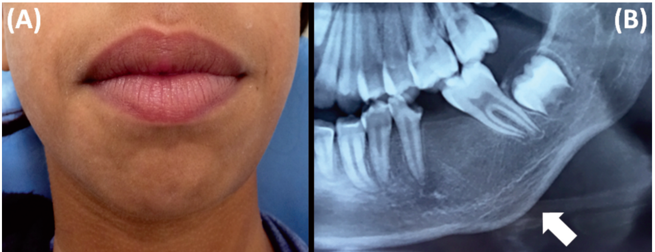
Figure 4: (A) Frontal view of the patient at the 6-month follow-up showing no facial asymmetry. (B) Panoramic radiographic image evidencing significant bone remodeling in the mandible ridge (arrow).

alveolar ridge. CT revealed an extensive periapical lesion evidenced by a well-delimited radiolucent area involving the apex of the compromised tooth, as well as new bone formation among the cortical border presented as radiopaque laminations that resembled onion peels. The findings were suggestive of Garrè's osteomyelitis (Figure 2).