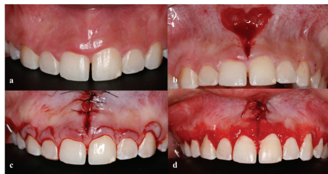
Figure 2: (a) Pre-surgical gingival condition, after orthodontic appliance removal (b) V-shaped incision of upper lip frenulum (c) Suture of the incision (d) Gingivoplasty surgery for crown lengthening.

The patient was instructed to use a 0.12% chlorhexidine digluconate mouthwash for 14 days. The frenectomy suture was removed within a 7-day postoperative period, and the patient reported great satisfaction with the preliminary results. Weekly post-surgical evaluations were performed during a 30-day period; no complications were reported, and there was complete tissue repair.