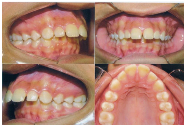
Figure 1: Initial intra-oral photos (pre-orthodontic treatment), demonstrating increased overbite and overjet, and dental superior diastemas.

A pre-surgical picture of the patient's smile was taken (Figure 2a); subsequently, infiltrative local anesthesia and isolation of the operative field with sterile gaze were performed.