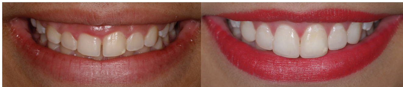
Figure: 4 (a) Initial smile, after orthodontic appliance removal (b) Smile after the multidisciplinary esthetic rehabilitation treatment.