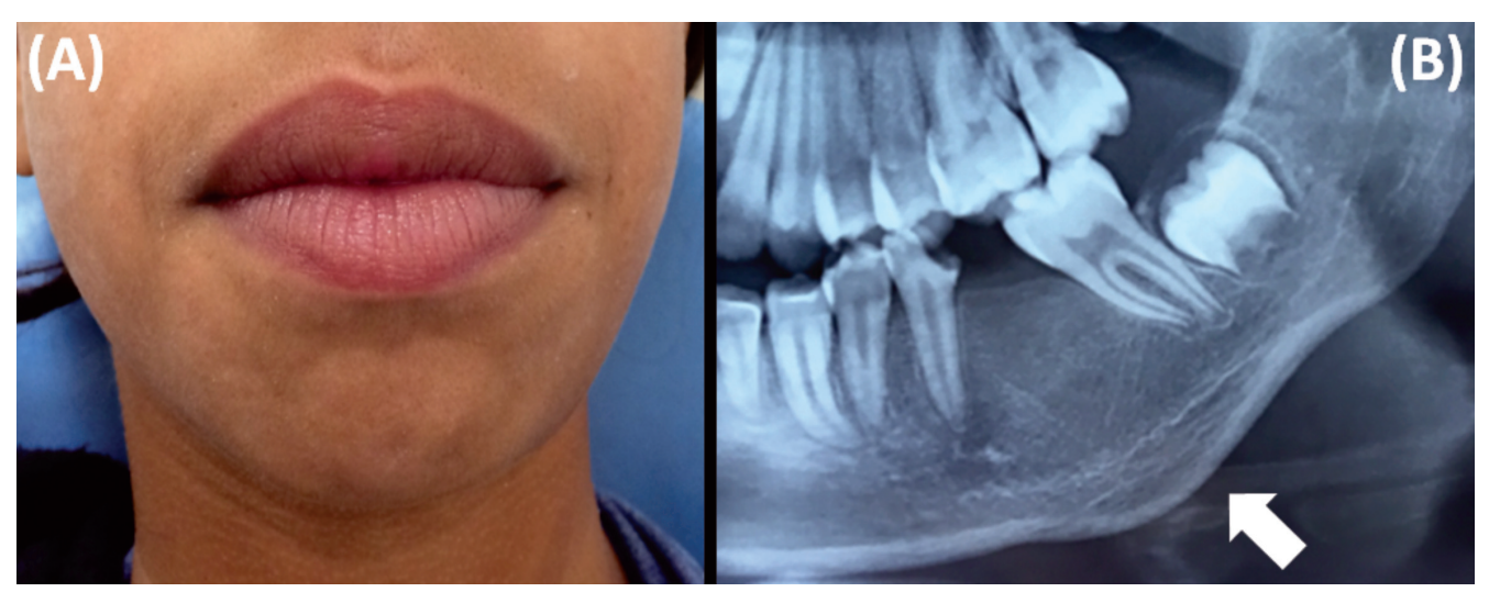
Figure 4 : (A) Frontal view of the patient at the 6-month follow-up showing no facial asymmetry. (B) Panoramic radiographic image evidencing significant bone remodeling in the mandible ridge (arrow).

alveolar ridge. CT revealed an extensive periapical lesion evidenced by a well-delimited radiolucent area involving the apex of the compromised tooth, as well as new bone formation among the cortical border presented as radiopaque laminations that resembled onion peels. The findings were suggestive of Garrè's osteomyelitis (Figure 2).