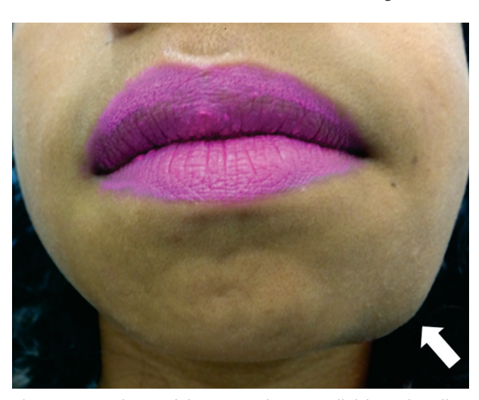
Figure 1 : Frontal view of the patient showing well-delimited swelling in left side of the jaw (arrow).

A 11-year-old black female patient was brought to the stomatology service of the Federal University of Rio de Janeiro, with complaints of toothache and facial asymmetry. The patient presented a large cavity in her permanent lower first molar, and extra-oral examination revealed increased volume on the left side of the mandible with firm consistency and slight skin color alteration (Figure 1); however, no cervical lymph node was detected. On intraoral examination, the patient showed an extensive cavity on the left mandibular first molar, extensive destruction of the dental crown that reached root furcation, and slight bulging of the vestibular