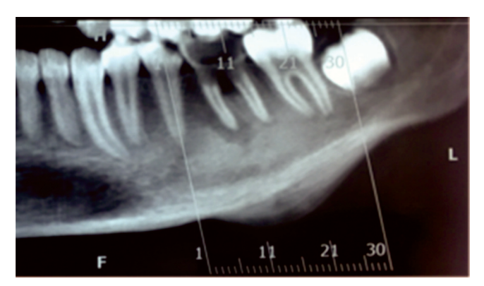
Figure 2: Panoramic reconstruction of cone beam CT showing an extensive radiolucent image associated with the first mandibular molar, with bone rarefaction and radiopaque bone laminations on the cortical surface resembling "onion peels."