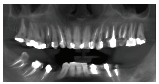
Figure 2: Initial X-ray showing teeth 15, 24, and 26 in need of extraction.