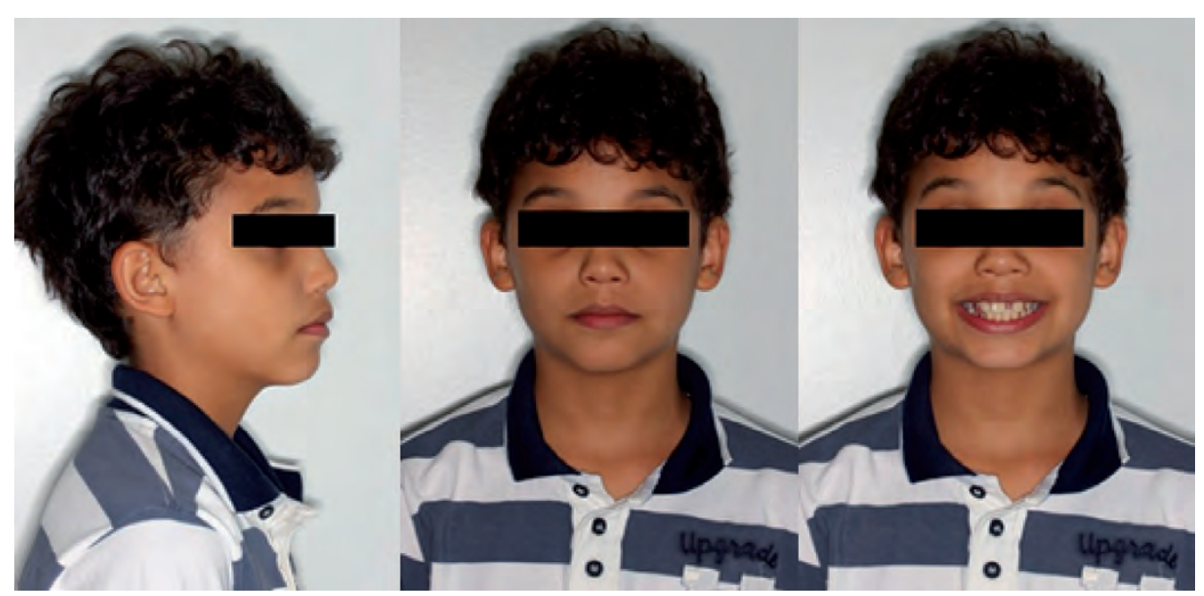
Figure 1: Extraoral photographs of the patient.