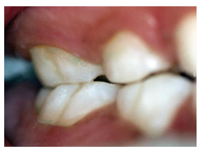
Figure 2 : Lateral view showing a satisfactory occlusion in the left posterior region at the six-month follow-up appointment.

drooling, inflammation of the gingiva overlying the tooth, gum irritation, increased biting and pain.<sup>3-5</sup> The theory of the role of the periodontal ligament in determining tooth eruption stipulates that this process occurs by the release of mediators and activation of cells directly involved in the inflammatory process.<sup>2-7</sup> It is also known that the incidence of physical forces influences the mitotic activity and collagen production by cells of the periodontal ligament, acting as a local adaptive response to repair damages.<sup>7</sup>